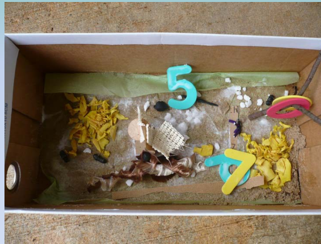
Trinity Chapel's Square