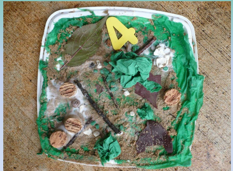
Grover Hill's Square