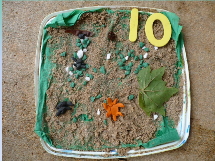
St George's Square

We enjoyed the Square of Life because we visited the Square lots of time to check if anything had changed.