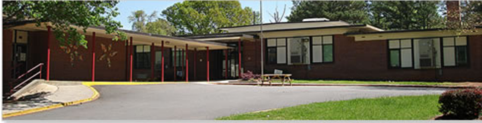
Marietta Center for Advanced Academics

MCAA (Marietta Center for Advanced Academics) is located in the city Marietta, Georgia. Marietta is a small city just north of Atlanta. Our school was originally built for children of Lockheed Martin workers who built the Bell Bomber airplanes in World War II. Our school is a magnet program for science, technology, engineering, and math (S.T.E.M.). At our school we have two creeks on our property that we monitor for our state. Once a month we test the creek water for pH, conductivity, temperature, and dissolved oxygen. We have a total of 250(two hundred-fifty) students at MCAA (Marietta Center for Advanced Academics). We love our school!!!