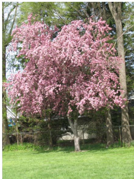
Crabapple trees in our schoolyard.