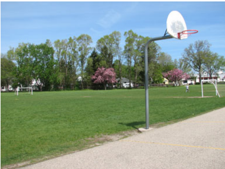
The playground in the back of Park Lawn. Notice the crabapple trees in bloom.