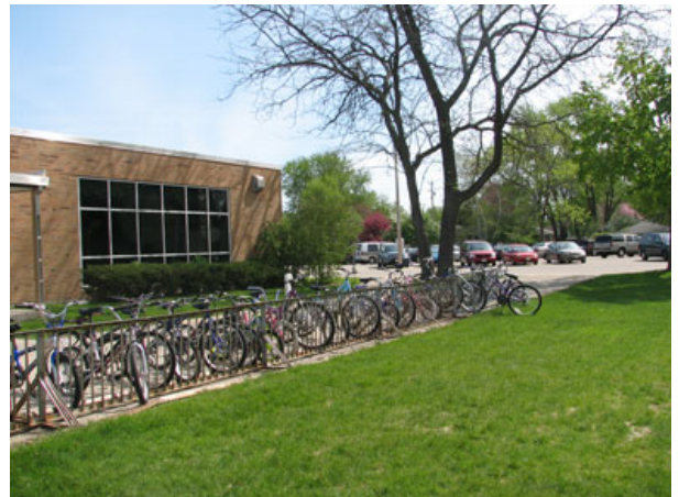
The side of our school; the windows look into our library.