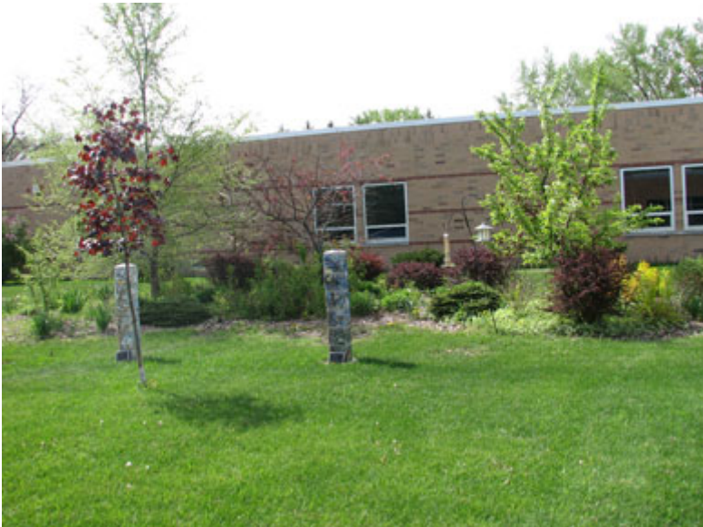
The courtyard in the center of our school building.

Between the schools we found many interesting differences and similarities. Along the way we learned about some fascinating new plants and trees we had never heard of before. Hopefully we will get to learn a little more about the Northern Mariana Islands, and San Antonio Elementary will learn a little bit about Oconomowoc Wisconsin.