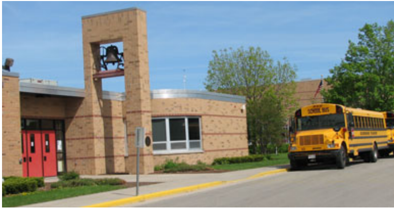
The front of Park Lawn.